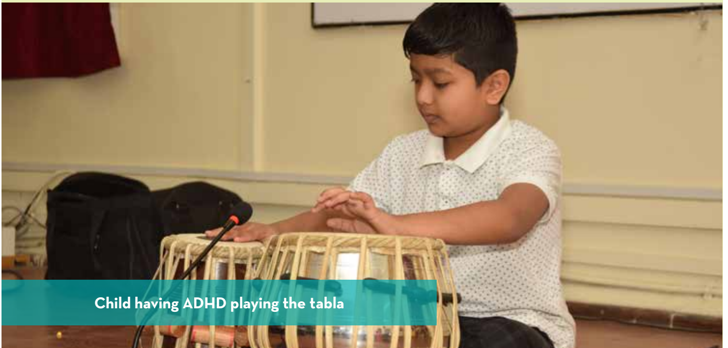
Child having ADHD playing the tabla