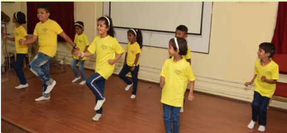
Performance by the children earlier diagnosed to have profound hearing loss now having a Cochlear Implant