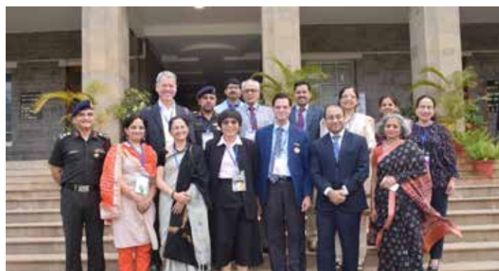
International and National faculty with the organising team members