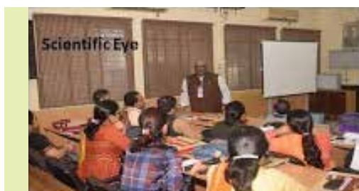
Pre - conference workshops